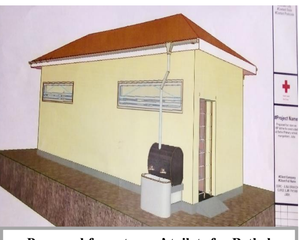
Proposed four stances' toilets for Bethel

These two SRC schools are facing three challenges: (1) running water (2) toilets and (2) pupils' feeding. Juba has no running water system; thus, water is daily bought from the water-tankers.