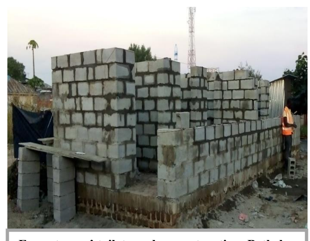
Four stances' toilets under construction, Bethel

The older and first school is Bethel Primary School, Mangateen Juba. It was started in 2017. The total number of pupils registered for 2021/22 were 514. It is the highest number Bethel could have since its inception. Progressively, this year Bethel has <u>Primary Eight</u>. The classroom for primary eight was also built with assistance from Word and Deed. Early next year 2022 primary eight pupils who are 40 in number will sit for the first time for South Sudan Primary Examination. This examination qualifies a person to enter Secondary School (High School).