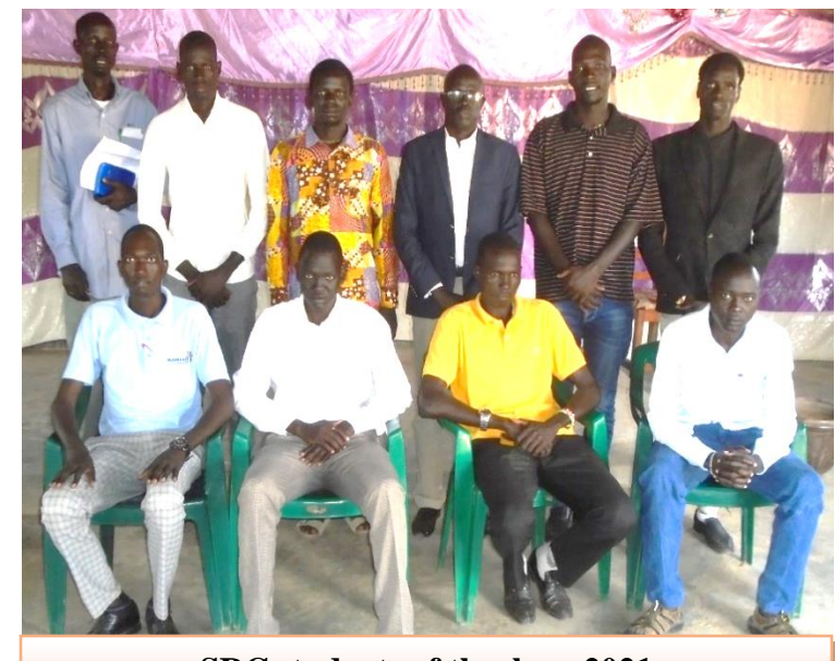
SRC students of theology 2021

Although SRC is still lacking well-trained Reformed pastors, indicators show that there is some progress in the leadership development. SRC in partnership with her sister-related churches are exerting all efforts to