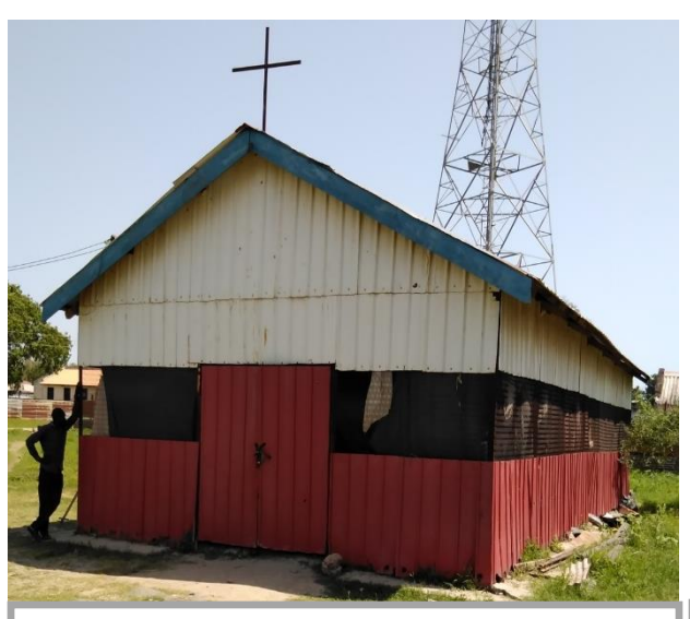
Immanuel SRC church building, Malakal

With eruption of civil war in South Sudan two years after independence, visiting areas outside of Juba has been extremely difficult. This came because of high risk of insecurity and expensive logistical cost to reach areas beyond Juba. By God's grace and the slow intensity of violence, this year some SRC leaders have carried out two pastoral visits to the congregations that were never visited since the conflict of 2013.