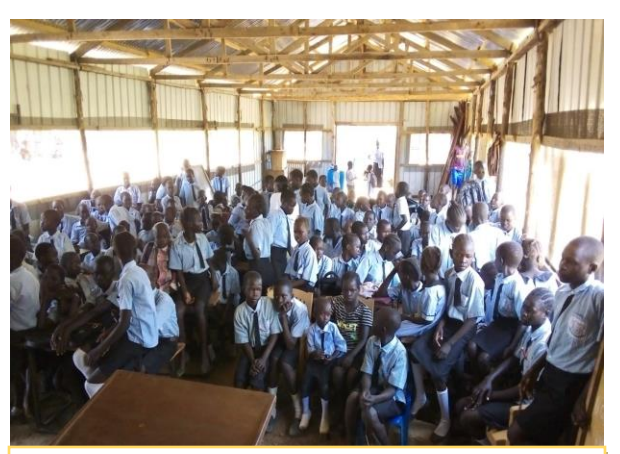
Grace Primary School pupils during Tuesday school worship service, Khor Wulyang Juba

The older and first school is Bethel Primary School, Mangateen Juba. It was started in 2017. The total number of pupils registered for 2021/22 were 514. It is the highest number Bethel could have since its inception. Progressively, this year Bethel has <u>Primary Eight</u>. The classroom for primary eight was also built with assistance from Word and Deed. Early next year 2022 primary eight pupils who are 40 in number will sit for the first time for South Sudan Primary Examination. This examination qualifies a person to enter Secondary School (High School).