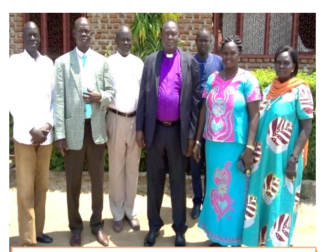
PCOSS&S Moderator (in the middle with pink shirt) visiting Bethel SRC Mangateen Juba