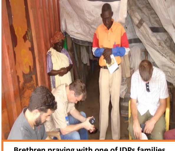
Brethren praying with one of IDPs families

It is to be noted that OPC and SRC are members of International Conference of Reformed Churches (ICRC). Ecumenically, ICRC is a global Reformed body that encourages ecclesiastical fellowship and unity among the member churches to present a Reformed testimony to the world. Such visits demonstrate meaningful and fruitful growth in the ecclesiastical relationships in ICRC global family.