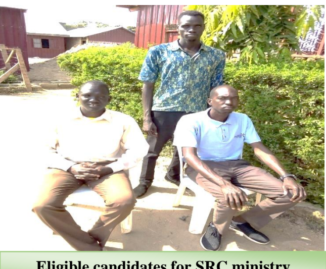
Eligible candidates for SRC ministry

Three SRC candidates who have successfully completed their studies this year were examined by Juba Classis on 8th December 2021. All of them passed their exams and were declared eligible candidates for the ministry of the Gospel at Sudanese Reformed Church. If they show commitment and zeal in the ministry, they will be the best SRC trained leaders with Reformed flavor.