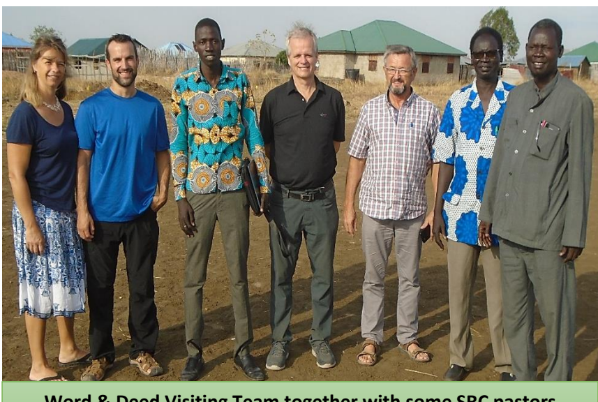
Word & Deed Visiting Team together with some SRC pastors exploring the reclaimed land Gudele Juba, March 2022

Ebenezer SRC was planted in early 2016. As a result of this church land plant а (70X100m<sup>2</sup>) was allotted to SRC by State Government of Central Equatoria State to accommodate the church plant activities. Beside the church plant, SRC planned to start a Christian school to provide educational services in the area. In July 2016 a heavy fighting erupted in Juba between government and opposition forces and because of rampant insecurity, killing and looting completely the area was deserted. The church plant came to halt. In 2018 the church