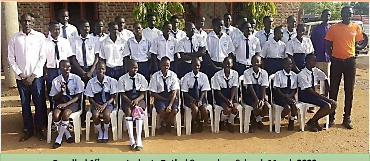
Enrolled 1<sup>st</sup> year students Bethel Secondary School, March 2023