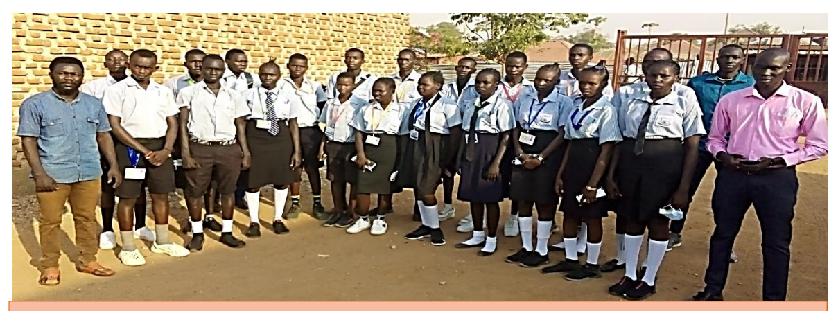
Bethel Primary School P8 candidates who sat for South Sudan Primary School Examination February 2023